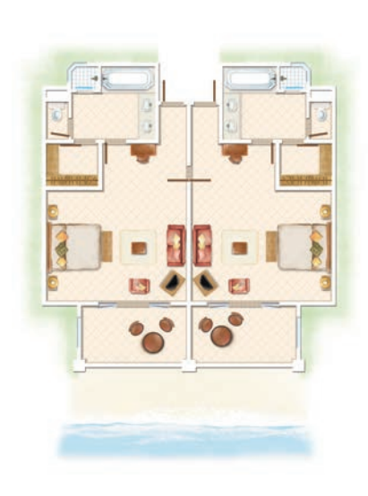
2-Bedroom Deluxe Family Apartment